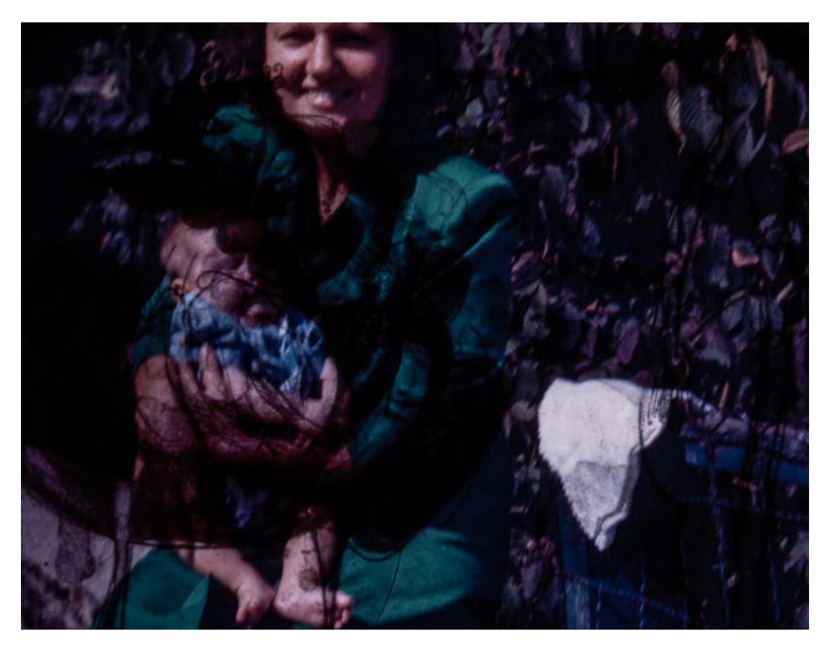
\label{eq:continuous} \begin{tabular}{ll} \textbf{Untitled} \\ \textbf{Another Resurrection Series - Photograph - Pigment Print Face-Mounted on Acrylic - Ed. 2/4 + 1 AP (NFS) - H90cm x L120cm x D4cm - <math>\textbf{A$5700}