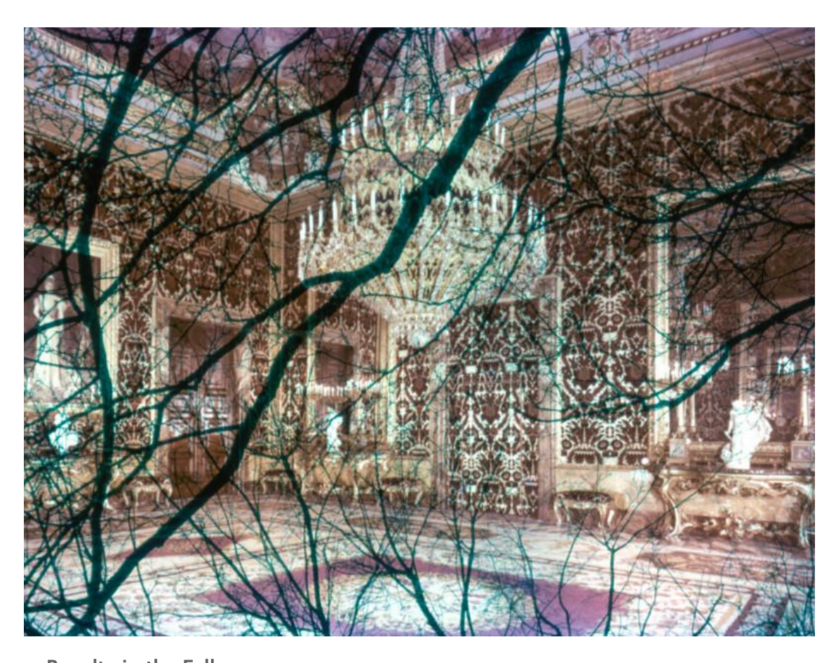
Royalty in the Fall Another Resurrection Series - Photograph - Pigment Print Face-Mounted on Acrylic - Ed. 2/4 + 1 AP (NFS) - H90cm x L120cm x D4cm - A$5700