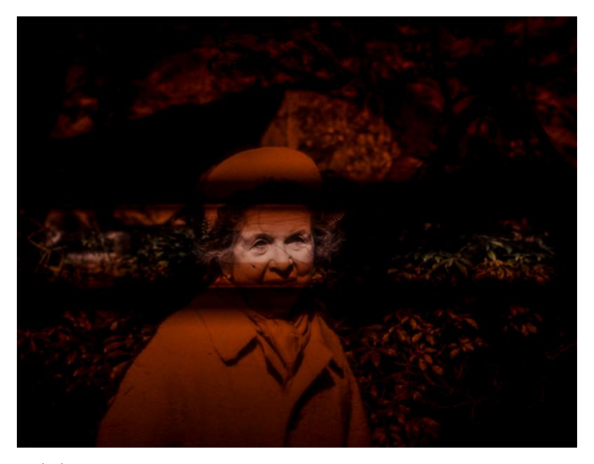
Black Lace Another Resurrection Series - Photograph - Pigment Print Face-Mounted on Acrylic - Ed. 2/4 + 1 AP (NFS) - H90cm x L120cm x D4cm - A$5700